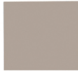
4948 Smoke Beige*