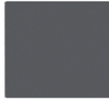
A21 Deep Charcoal