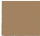
A53 Arizona Tan

Review Tech-Data Bulletins and MSDS before use. Visit www.scofield.com for the most current versions.