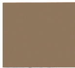
A65 Pecan Tan