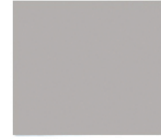
5183 Stone Gray*