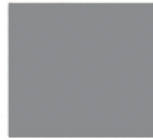
A57 Platinum Gray