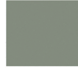
A85 Muted Green